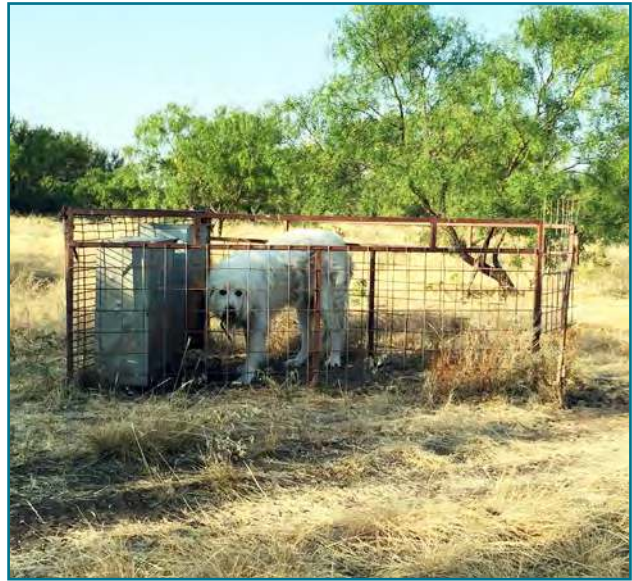
FIGURE 5. This self-feeder is made from three panels arranged as a triangle. The right side of the pen and has a small panel with a 2-foot space at the bottom for dogs to go under.

The number of dogs required for optimal protection varies according to the size of pasture, number of herd groups, topography, flocking instinct of the livestock, number and species of predators, fencing, and guardian dog behavior. The general recommendation is one dog per 100 ewes or does. However, this number is not absolute. Except for small flocks that are close to the house, two dogs are probably more desirable because if one dog is lost the animals will still be protected. On the other hand, flocks of 1,000 or more seldom have more than six LGDs. Start with one or two dogs and evaluate their effectiveness after they reach maturity. Adding newly bonded dogs to a herd that has a mature and effective LGD already in place, is often more successful than starting with three or more untrained dogs. Younger dogs learn from