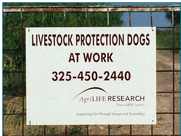
FIGURE 2. Ranchers should use signage that indicates livestock guardian dogs are in the area. This can prevent conflict and provide contact information for people who suspect a problem.

Before you release a guardian dog, tell your neighbors you are adding a dog or dogs to the ranch and what steps you would prefer they take if your dogs are found off the property. It is wise to use dog tags that include contact information and indicate that the dog is a livestock protection animal. Post signs on the ranch boundary with public roads to inform people that guardian dogs are working (Fig. 2).