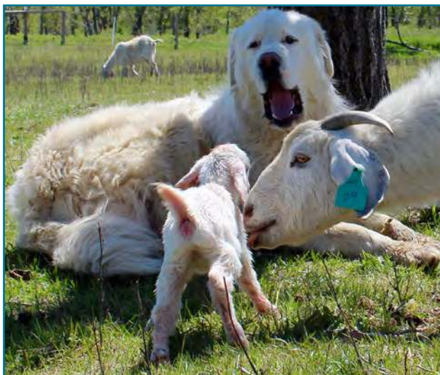
FIGURE 6. Dogs are attracted to animals at parturition and provide added protection when small ruminants are most susceptible to predation.

Health care for LGDs should be planned carefully in consultation with a licensed veterinarian and include scheduled vaccinations, deworming, and heartworm prevention. You should also control external parasites, such as fleas and ticks. Consider rattlesnake vaccines as added protection for LGDs because they are more likely to encounter rattlesnakes than normal pets. Some breeds of guard dogs require grooming to prevent matted coats and heat stress. On occasion, a dog will need help removing porcupine quills. Longevity is one of the most important ways to reduce LGD cost—good health care is essential.