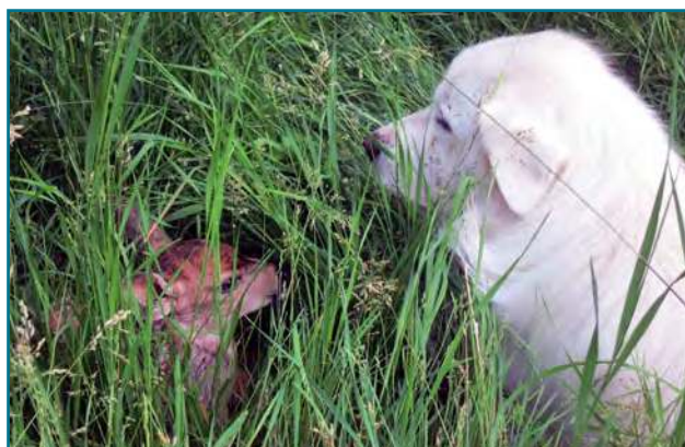
FIGURE 8. This guardian dog found a newborn fawn hidden in tall grass. The guardian dog provided a safe haven for the deer. In other situations, guardian dogs may prey on newborn fawns. How a dog behaves depends on the dog and its environment during the bonding phase.

On many sheep and goat operations, fee hunting for whitetail deer is an important revenue source. Small numbers of guard dogs have been documented to chase, harass, and kill deer. In these instances, the guard dog has identified the deer as a trespasser. If this behavior cannot be corrected, the dog might need to be removed or restrained from specific areas at certain times of the year. On the other hand, dogs that do not interfere with deer and keep predators away provide a safe haven for deer to rear their offspring (Fig. 8). Recent reports indicate that captive deer breeders are using LGDs to decrease predation of fawns.