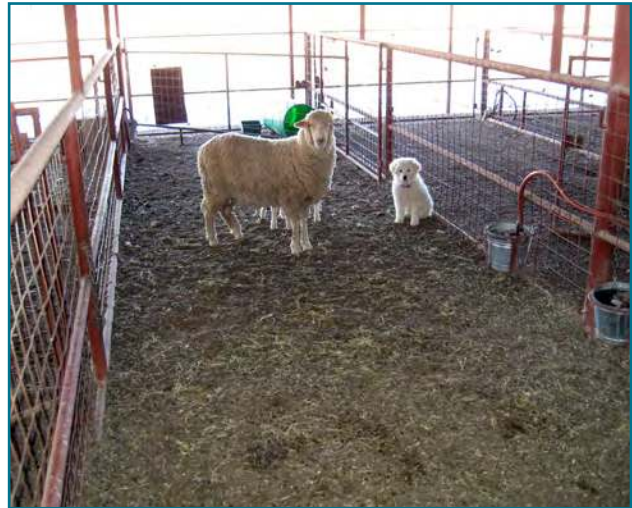
FIGURE 3. This is a bonding pen for young livestock guardian dogs. In this case, a ewe with lambs are being used. It is important to use animals that are accustomed to guardian dogs and include all species of livestock the dog may be required to protect. Do not allow the dog to bite or chew on weak or small animals. The area in the background is blocked off for the guard dog and its feeding station.

The ideal time to begin bonding guardian dogs to livestock is from 4 to 8 weeks of age, while they are still nursing. Research indicates that dogs might not properly bond with livestock if the bonding phase is started after the dog is 16 weeks old.