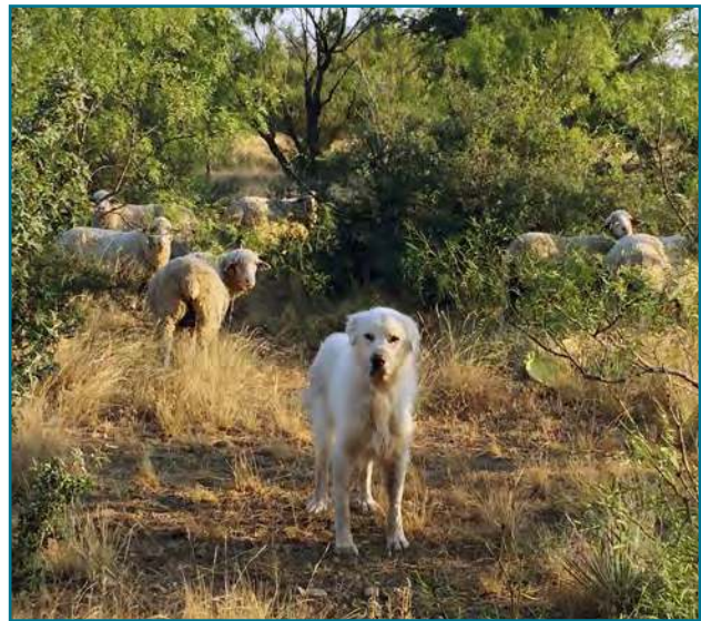
FIGURE 1. Most often, the dominant guardian dogs will investigate disturbances in a pasture and create a buffer space between themselves and their flock/herd.

Some breeders market fully trained or bonded livestock guardian dogs. If you do not have guardian dogs and are suffering heavy predation, this is a good option because trained dogs can begin working immediately. Conversely, it takes 12 to 24 months for puppies to become effective guardians. Trained dogs are more expensive but they are often worth the investment. This is especially true if the breeder offers money back or full replacement guarantees. The risks with purchasing a trained LGD include their running away or failure to bond with